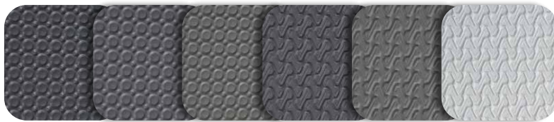
U-TREAD™ OCTI PATTERN

U-TREAD™ in moulded Octi and Z patterns is a hard wearing deck tread suitable for floors, gunwales, trailers and general wet areas, improving safety when out on the water, and increasing the overall protection of your boat.