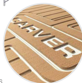
Custom logos with bevelled edges